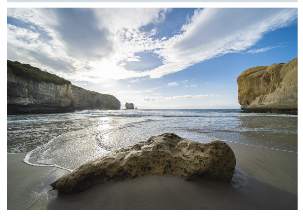
Designed & Printed by Digiart & Design Ltd www.digiart.nz